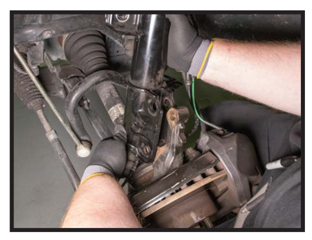
FIGURE 9 FIGURE 10

12. WITH THE AIR STRUT REMOVED, YOU CAN NOW GAIN ACCESS TO ITS HOSE CONNECTION. SLOWLY REMOVE THE FITTING TO DEFLATE AND FREE THE ASSEMBLY. REMOVE THE AIR LINE FITTING FROM THE AIR HOSE AND DISCARD. (FIGURE 11)