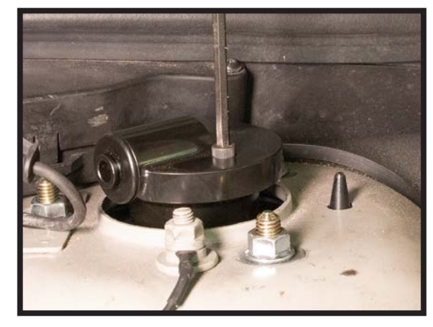
FIGURE 19 FIGURE 20

8. INSTALL THE ELECTRICAL PLUG INTO THE DAMPER. (FIGURE 21)