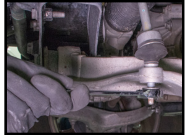
LOOSEN AND REMOVE THE UPPER CONTROL ARM NUT. (FIGURE 5)