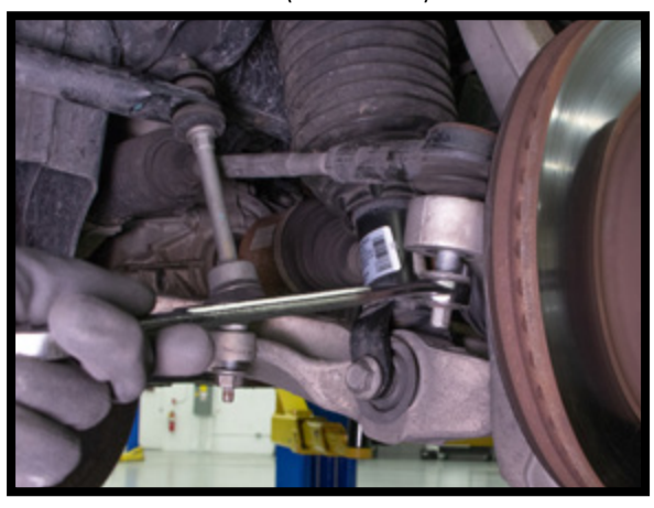
FIGURE 2 LOOSE AND REMOVE THE TWO SWAY BAR END LINK NUTS. (FUGURES 3, 4)

4. LOOSEN AND REMOVE THE TIE ROD END NUT. (FIGURE 2)