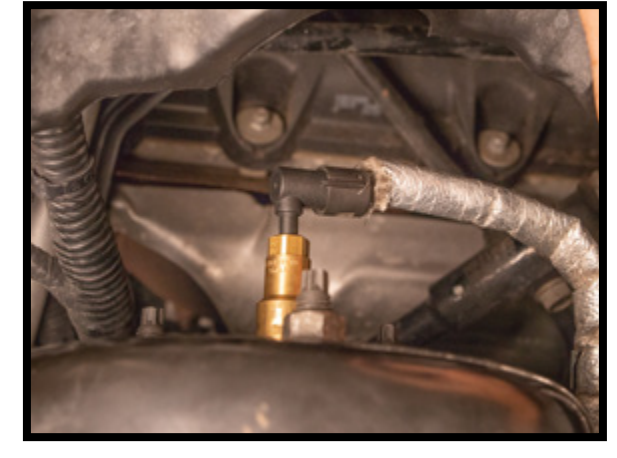
FIGURE 15 FIGURE 16

17. INSTALL THE UPPER CONTROL ARM NUT AND TIGHTEN TO MANUFACTURER'S SPECIFICATIONS. (FIGURE 17)